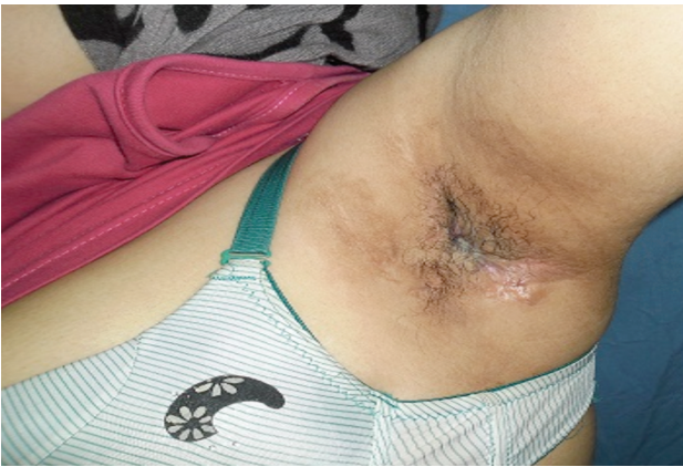
Fig. (5): Female patient with Lt sided axillary hidradenitis suppurativa together with design of propellar TDAP flap.