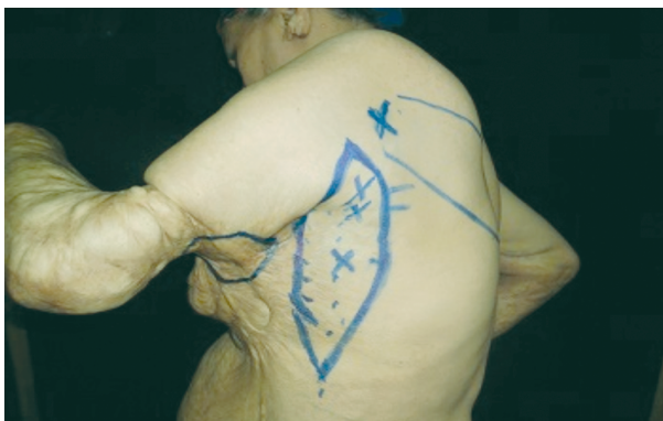
Fig. (9): The same patient with preoperative marking of the perforators of the thoracodorsal and circumflex scapular arteries.