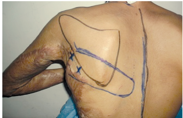
Fig. (2): The same patient; after preoperative marking of the propeller CSAP and the flap with a handheld Doppler.