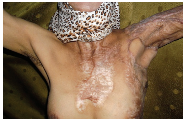
Fig. (4): The same patient four months after discharge with complete healing of the flap and improved degree of shoulder abduction.