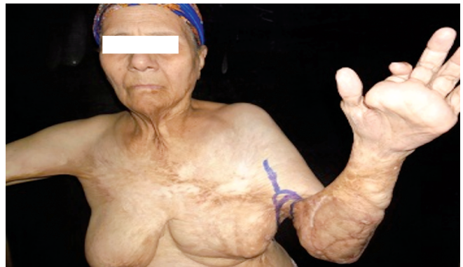
Fig. (8): 65ys old female patient with type (III) axillary contracture with hidden squamous cell carcinoma inside the contracture.