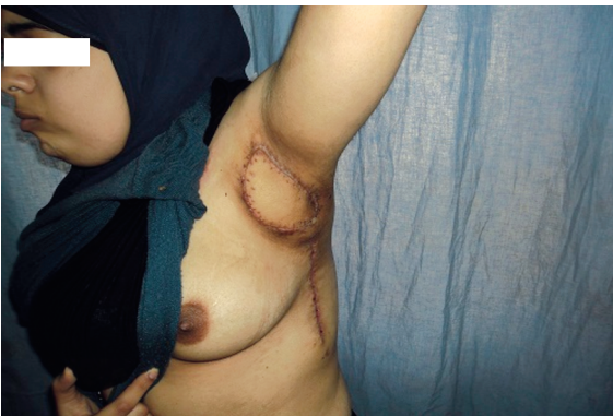
Fig. (7): The same patient after excision of the lesion together with reconstruction using propellar TDAP flap with 1ry closure of the donor site.