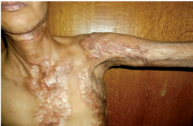
Fig. (1): Female patient with type (III) post. Burn lt sided axillary contracture.

Case (15): 65 years old female patient with type (III) axillary contracture with severe limitation of shoulder abduction (Fig. 8) resulting from flame burn o the axilla dating 30 years ago with hidden marjoline ulcer discovered accidentally after admission to the plastic surgery unit where she was complaining of bloody foul smelling discharge from the armpit. For which she was investigated with axillary ultrasound and biopsied. The patient was operated for release of the contracture and excision of the tumour with adequate safety margin resulting in exposure of the axillary artery, vein and neural structures. Coverage was done with propeller CSAP flap 20 x 8cm rotated 90° together with 1ry closure and grafting of the donor and recipient sites Figs. (9,10).