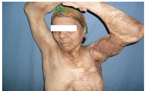
Fig. (10): The same patient; five months postoperative with complete healing of the wound. With improvement in the degree of shoulder abduction.